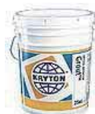
KWS Krystol® Waterstop Systems