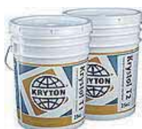
T1 T2 Krystol® Surface Applied System