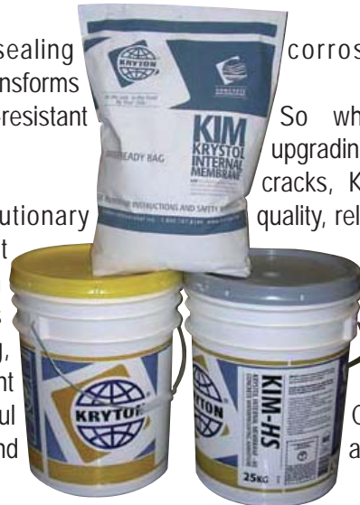
KIM Krystol® Admixture Systems

Other range of products offered by Rovski Sdn Bhd: Sealant and Adhesive products for Construction, Automotive, Metal and Wood Industries.