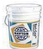
CRS Krystol® Crack Repair Systems